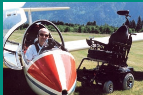
DOWN TO EARTH: GLIDING AT HOPE AIRSTRIP, NEAR VANCOUVER, B.C.